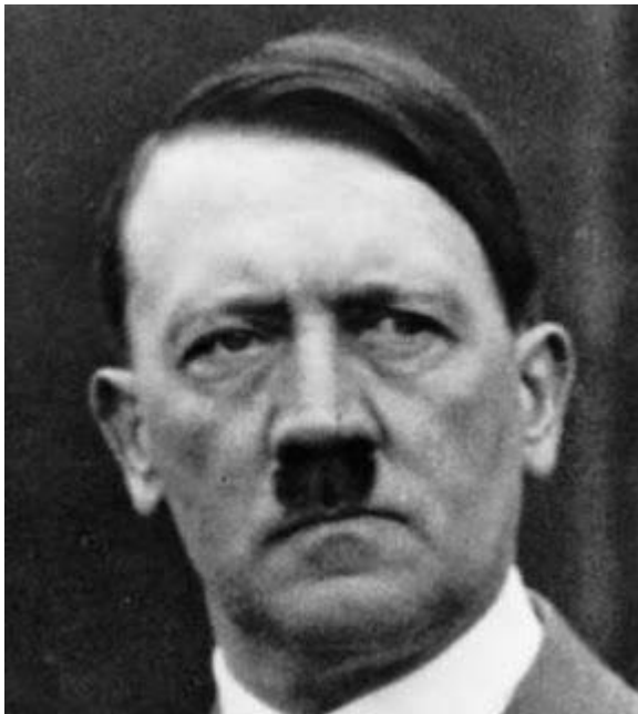
Adolf Hitler, Fuehrer of Germany

Here are some things to consider before respecting Adolf Hitler, Fuehrer of Germany.