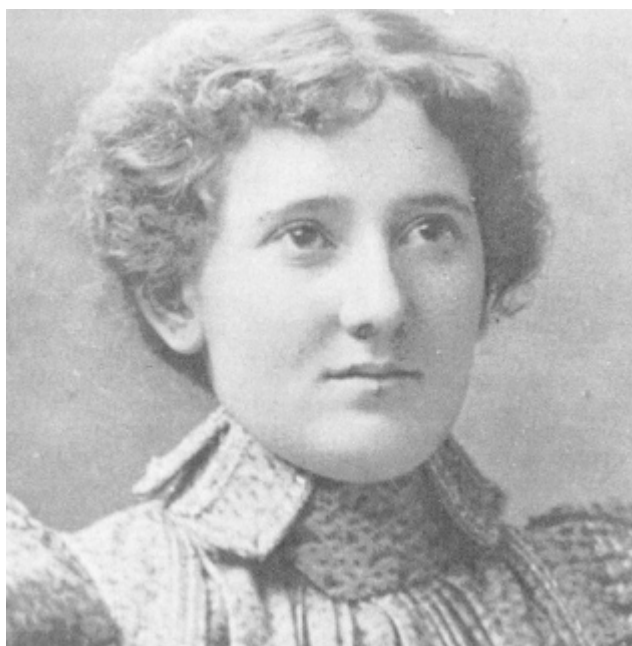
Maria Anna Schicklgruber, Adolf

"Adolf's father, Alois Hitler, was the illegitimate son of Maria Anna Schicklgruber .... Maria Anna Schicklgruber was living in Vienna at the time she conceived. At that time she was employed as a servant in the home of Baron Rothschild. As soon as the family discovered her pregnancy she was sent back home ... where Alois was born."